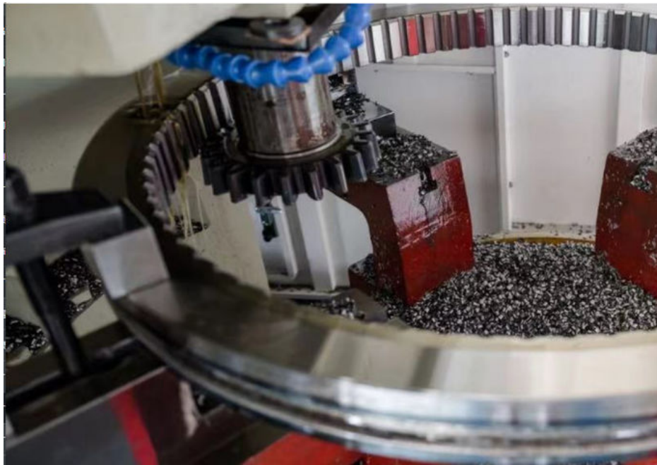
HEAT TREATMENT(HRC 55-62)